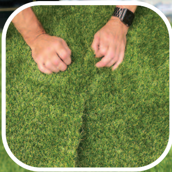
◀ *Main picture illustrates joints that are produced using a tape/glue machine